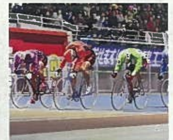
Media Dome 北九州综合性球馆(北九州 Media Dome)