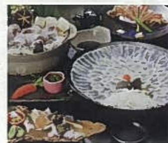
Fugu (blowfish) from Kanmon Strait 关门的河豚