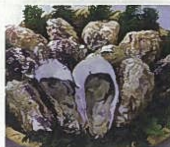
Buzen Hitotsubu Oyster 丰前一粒牡蛎