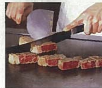
Kokura Beef 小仓牛