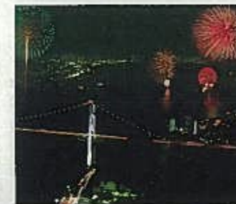
Kanmon Strait Firework Festival 海峡焰火大会