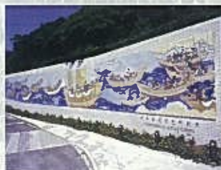
Battle of Dannoura 坛之浦战争

门司港于 1889 年开港。之后，结合了支持着近代日本发展的北九州工业能力，成为重要的大陆贸易港。以前曾是国际贸易港的街道，而今蜕变成同时融合了古老的大街与崭新的都市机能的观光地——“门司港怀旧区”，来自市内外的游客们，又为其增添了新的热闹景象。