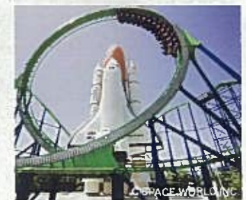
SPACE WORLD 太空世界(SPACE WORLD)