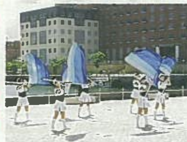
Performance by the fire brigade band 消防乐队的表演