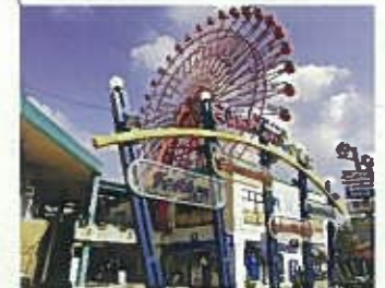
Cha Cha Town Kokura Chacha Town 小仓