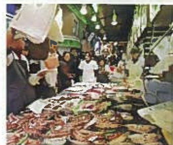
Tanga Market 旦过市场