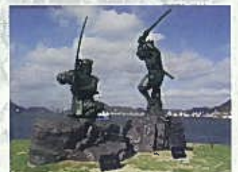
Duel on Ganryujima Island 岩流岛的决斗