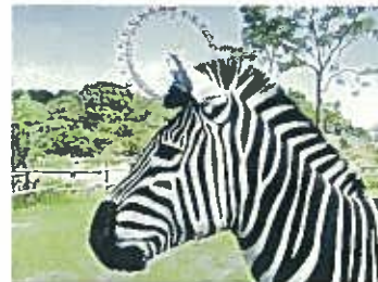
Itozu-no-mori Zoological Park

热带生态园、大草坪广场等，一年四季都可以欣赏到种类各异的众多花卉。同时设有可以和动物近距离接触的hibiki动物世界。