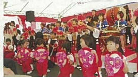
Drum performance and Kasa dance 太鼓演奏与伞舞