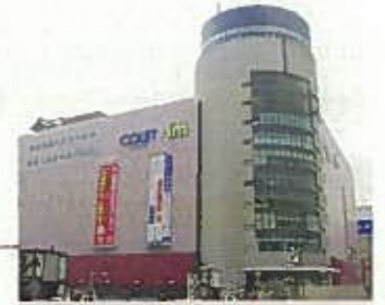
COLET COLET Major Brands/ Paul Smith, Christian Dior, Prada, Bulgari, L'Occitane, and more. (As of June 1, 2009)