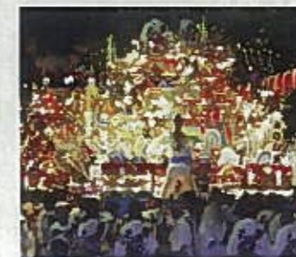
Kurosaki Gion Yamakasa Festival 黑崎祇园山笠