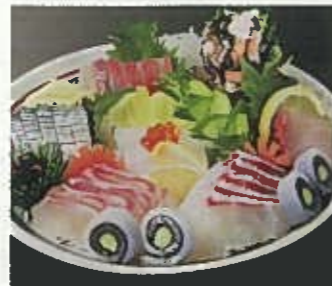
Sliced sashimi 生鱼片

美味，常存在旅游的回忆之中。关门海峡的名产是“河豚”、“一粒牡蛎”，以及肉质新鲜带有脂肪且肌理细致充满魅力的“小仓牛”等，有各式各样让人“真想品尝看看！”的美味。“旦过市场”等处是市民平常采购食材的地方，建议您也到这些充满活力的食物宝库走走看看。这里有许多北九州当地才有的新鲜海产、山中土产，欢迎您来尽情游览。