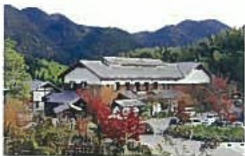
Ajisai Hot Spring

有木质地板的走廊及休闲长椅的洞海湾海岸线。这里被称为若松外滩（若松外滩：东洋港口城市的海岸大街），可以欣赏恬静美丽的景观。