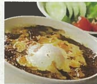
Roasted curry 烤咖喱