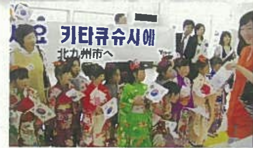
A welcome in kimono 身着和服前来迎接